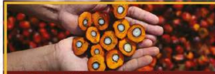
Palm Oil Processing Industry

Business opportunities in the downstream sector include product derivatives of Crude Palm Oil (CPO) and Palm Kernel Oil (PKO) which is classified into food and non-food products.