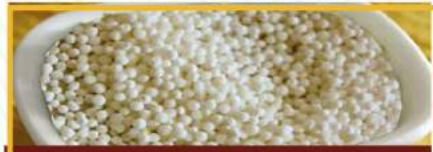
Sago Processing Industry

Product derivatives of CPO and PKO for the food categories are cooking oil, salad oil, shortening, margarine, Cocoa Butter Substitute, food emulsifier, vanaspati, vegetable ghee, fat powder and ice cream. And for the non-food categories are surfactant, biodiesel and other oleochemical derivatives.